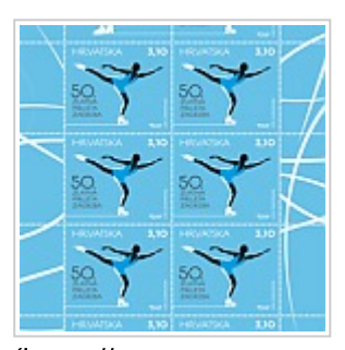
(https://www.wopaplus.com/en/stamps/product/&pid=40728) Sheetlets GBP £3.18

(https://www.wopaplus.com/en/stamps/product/&pid=40726) Set GBP £0.35